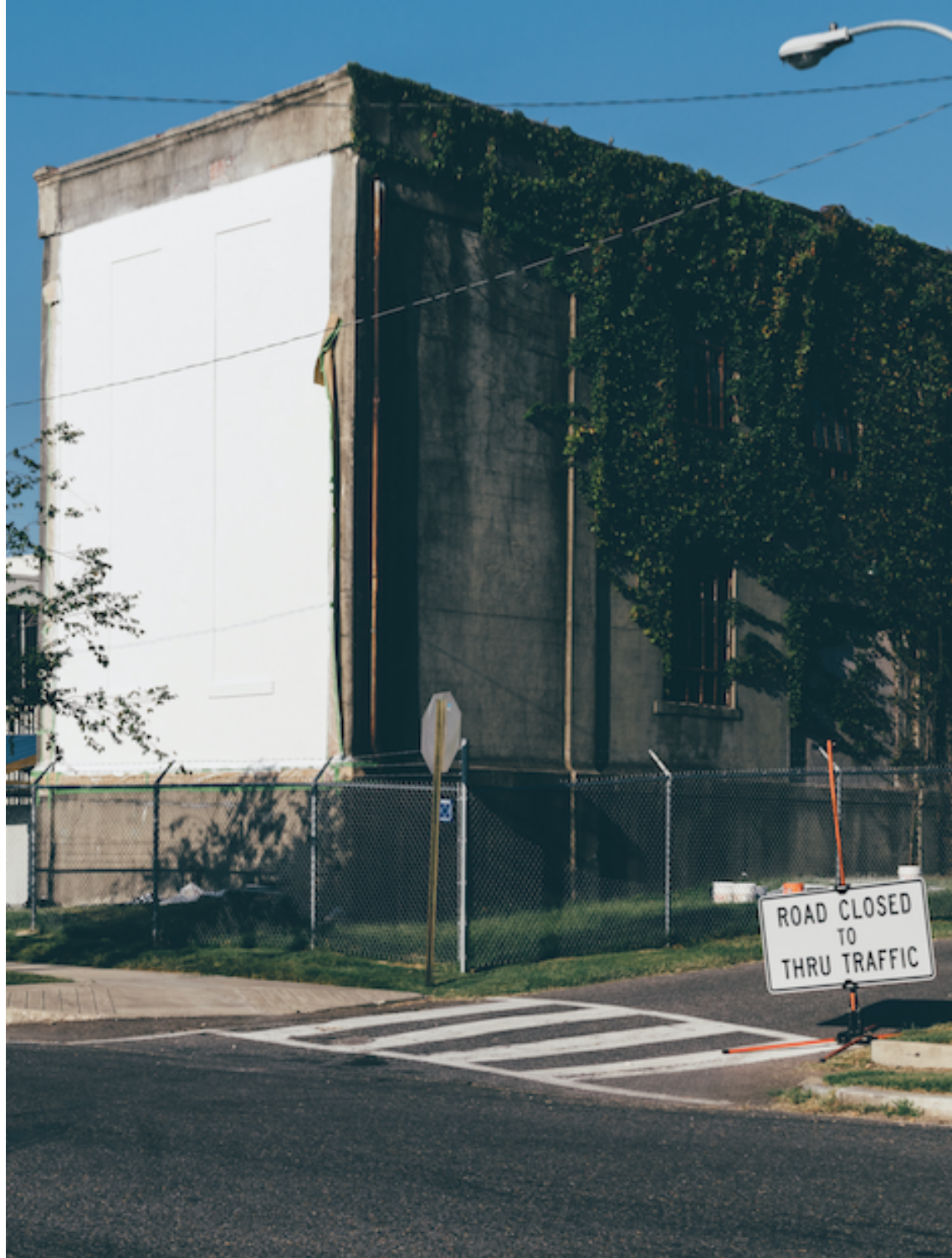
Water Basins, Khara Woods photo by: